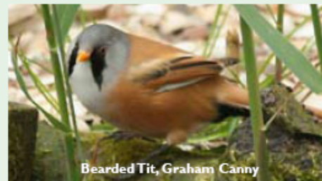
Bearded Tit, Graham Canny