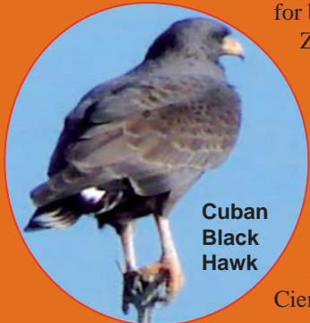
Cuban Black Hawk

Feb. 20-22: Early morning departure to the Zapata Peninsula, stopping en route for boat trip along the River Hatiguanico to look for the endemic Zapata Sparrow & Zapata Wren. Afternoon visit to the Bermejas region to search for Bee Hummingbird, the world's smallest bird, plus endemic Cuban Parakeet & Blue-headed Quail-dove. Next morning visiting Las Salinas, an area of shallow salt pans to look for Greater Flamingos, Neotropic Cormorant, Brown Pelican, Royal Tern, Reddish Egret, White Ibis and the endemic Cuban Green Woodpecker, Cuban Crow & Cuban Black Hawk. Further full day excursion to the town of Trinidad, a superb World Heritage Site, stopping en route at the Soledad Botanical Gardens in Cienfuegos. 3-night stay at the Batey Don Pedro .